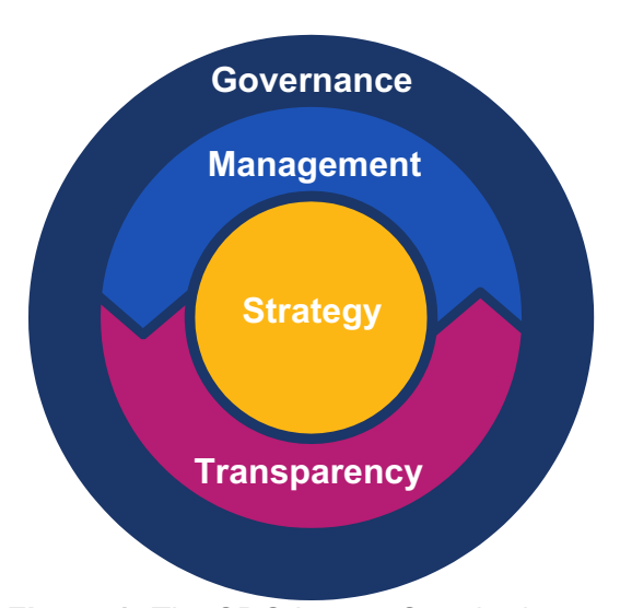
Figure 1: The SDG Impact Standards

The Standards are organized around four interconnected themes – strategy, management approach, transparency, and governance (see Figure 1) – each of which plays an important role in fully integrating sustainability and contributing positively to the SDGs into organizational systems and decision making.